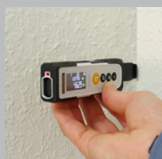
Pin for measurements out of a corner