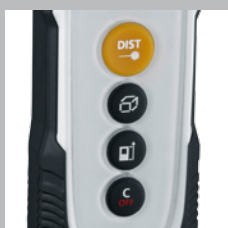
Multi purpose functions